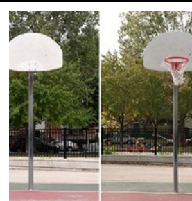
Return of the basketball rims by Mick Dumke | Oct 26, 2011