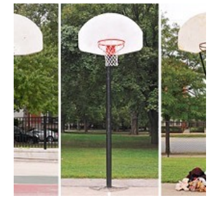
Basketball controversies by Mick Dumke and Kevin Warwick | Sep 22, 2011