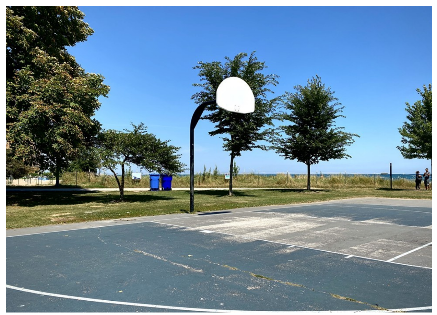
The Loyola Park basketball court in Rogers Park without rims in August 2018. Loyola Park does not feature on the Chicago Park District's list of inactive courts, and it is unclear why the rims here have not been restored here since Chicago resumed park access in its phased reopening.

Meanwhile, between 2010 and 2020 the park district removed 64 tennis courts across the city, mostly from Black and Brown neighborhoods on the south and west sides. Inevitably, these decisions, however innocuous they may truly be, reinforce the stereotypes associated with tennis as a predominantly white, exclusive sport. When contrasted with the data on deactivated basketball courts, their racial underpinnings become starker.