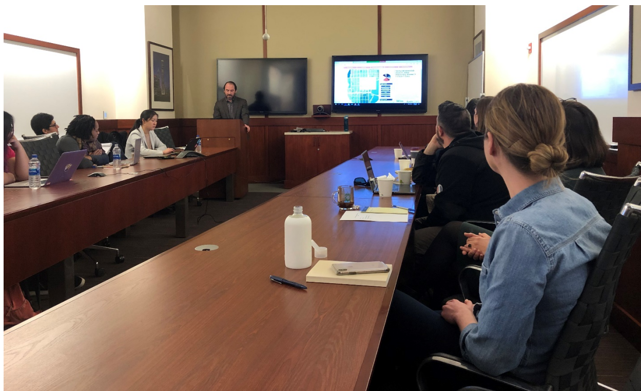
Photo Caption: The Connect Chicago Innovation Program winners met with City Tech and community experts on July 18, 2019 to workshop the initial project concept.

For example, feedback from stakeholders in East Garfield Park indicated that the diversity of retail establishments and commercial landlords made it difficult to develop strategies for part of the community, but knowing locations of industrial and warehouse spaces in the neighborhood could help inform workforce development strategies. Conversely, stakeholders in Little Village were interested in learning more about local businesses and commercial building owners to better coordinate outreach efforts and bring local business owners into neighborhood networks. Some noted that data on the mix of assets in the community could inform strategies to attract new businesses that are aligned with community needs.