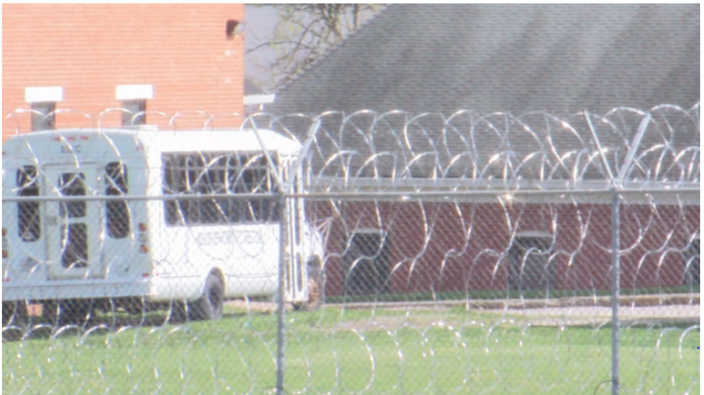
Several groups are coming together to host a town hall to address the health and safety of incarcerated Missourians. (File)