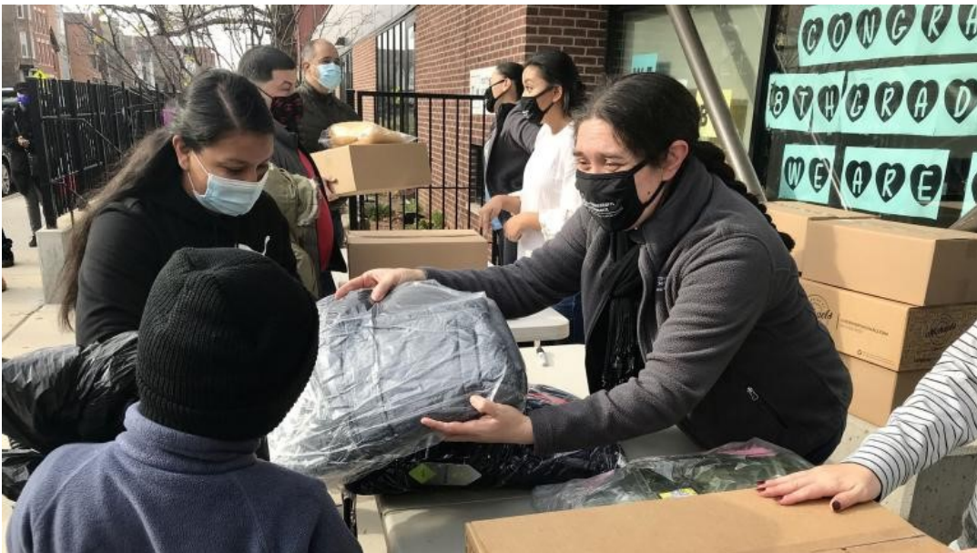
(/2020/12/17/report-black-latino-families-struggling-food-housing-security-during-pandemic) Report: Black, Latino Families Struggling with Food, Housing Security During Pandemic (/2020/12/17/report-black-latino-families-struggling-food-housing-security-during-pandemic)