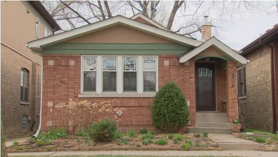
(/2021/01/08/pritzker-extends-ban-coronavirus-related-evictions-until-feb-6) Pritzker Extends Ban on Coronavirus-Related Evictions Until Feb. 6 (/2021/01/08/pritzker-extends-ban-coronavirus-related-evictions-until-feb-6)