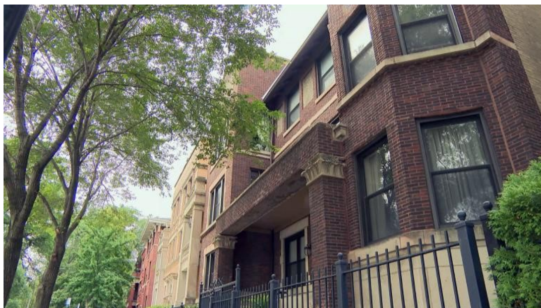
(/2020/12/08/anti-gentrification-measure-extended-6-months-officials-craft-new-plan) Anti-Gentrification Measure Extended for 6 Months as Officials Craft New Plan (/2020/12/08/anti-gentrification-measure-extended-6-months-officials-craft-new-plan)