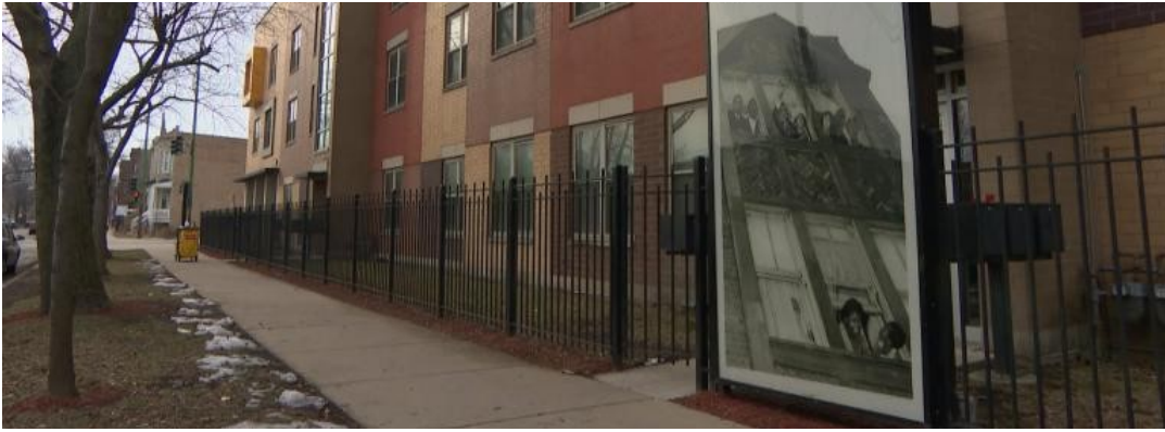
(/2021/01/17/lawndale-legacy-martin-luther-king-jr-fight-fair-housing) Lawndale Legacy: Martin Luther King Jr.'s Fight for Fair Housing (/2021/01/17/lawndale-legacy-martin-luther-king-jr-fight-fair-housing)