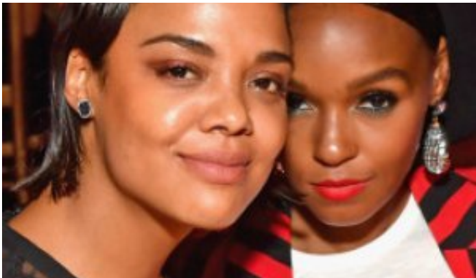
Tessa Thompson Opens Up About Relationship with Janelle Monae