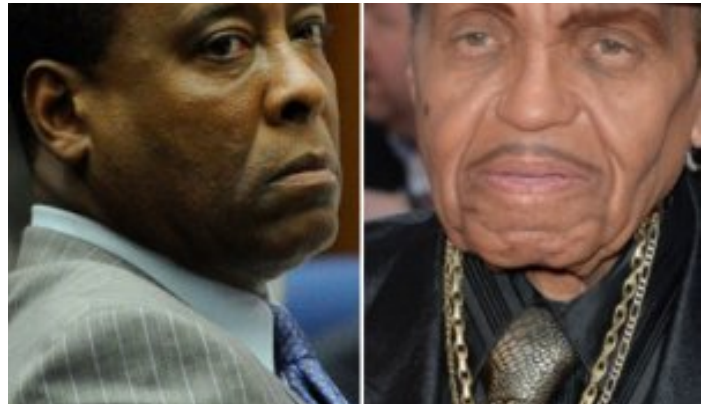
Conrad Murray's Harsh Words for Joe Jackson After His Death