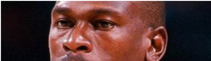
Incredible Athletes Currently in Jail Grunge.com