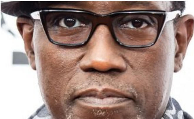
This is Why We Stopped Seeing Wesley Snipes in Movies Looper.com