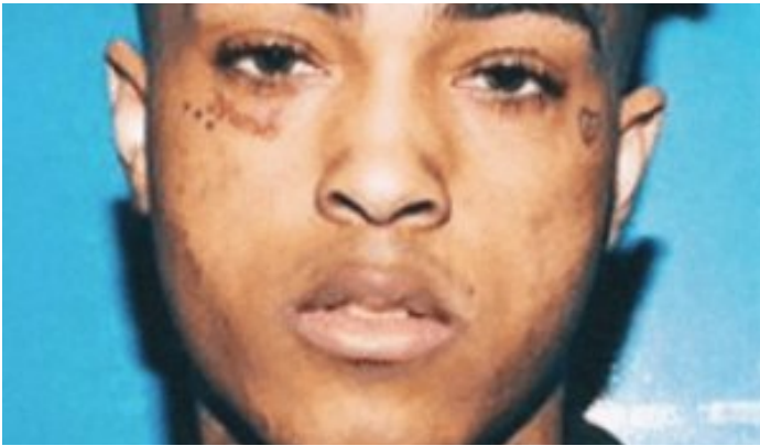
XXXTentacion's Will Reveals Who He Left Everything To