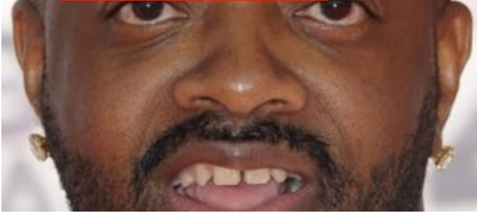
Rappers Who Were Born Filthy Rich NickiSwift.com