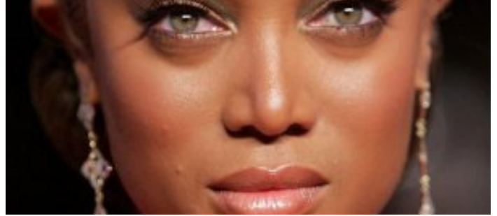
Tyra Banks's Devastating Downfall NickiSwift.com