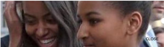
The Stunning Transformation of the Obama Sisters NickiSwift.com