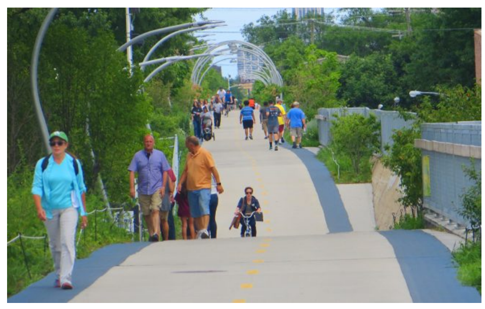
The 606 trail

The residential market near the western end of the 606 trail is so hot that some residents say they get daily unsolicited offers to sell their homes.