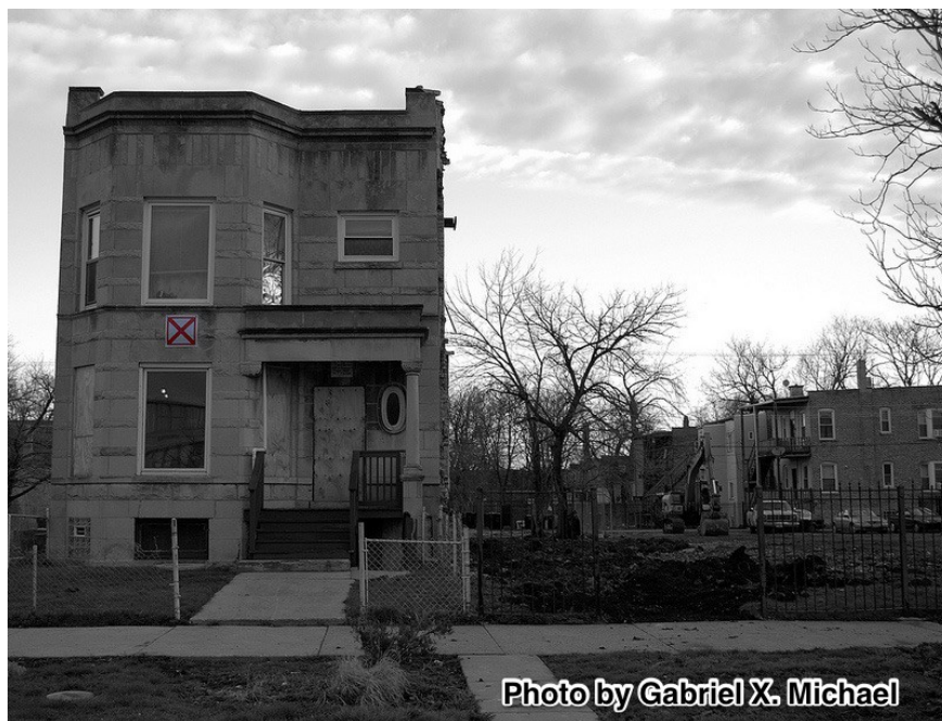
A nearly identical graystone attached to this one in Humboldt Park was demolished.

We frequently post on social media the individual building permits which indicate the loss of small apartment buildings (mostly 2- and 3-flats) through deconversions to single-family houses, and teardowns ( demolitions frequently replaced by single-family houses).