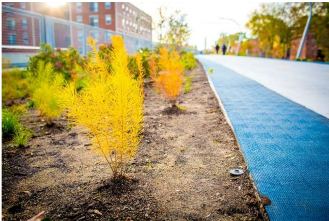
The 606.

The 606 was a magnet for anti-gentrification demonstrations last year—and that was even before a report detailed just how sharply housing costs have spiked near the popular rail-to-trail pathway. Two aldermen whose wards fall in affected areas are now looking to reverse the trend.